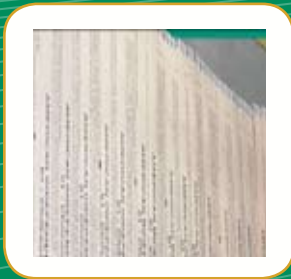
New, light-weight ballot stock