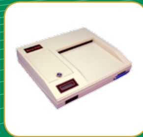
Great deals on gently used Election System units.