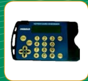
Election Day supplies, equipment, accessories and much more!

Some quantities limited. Order by calling 866-224-1792!